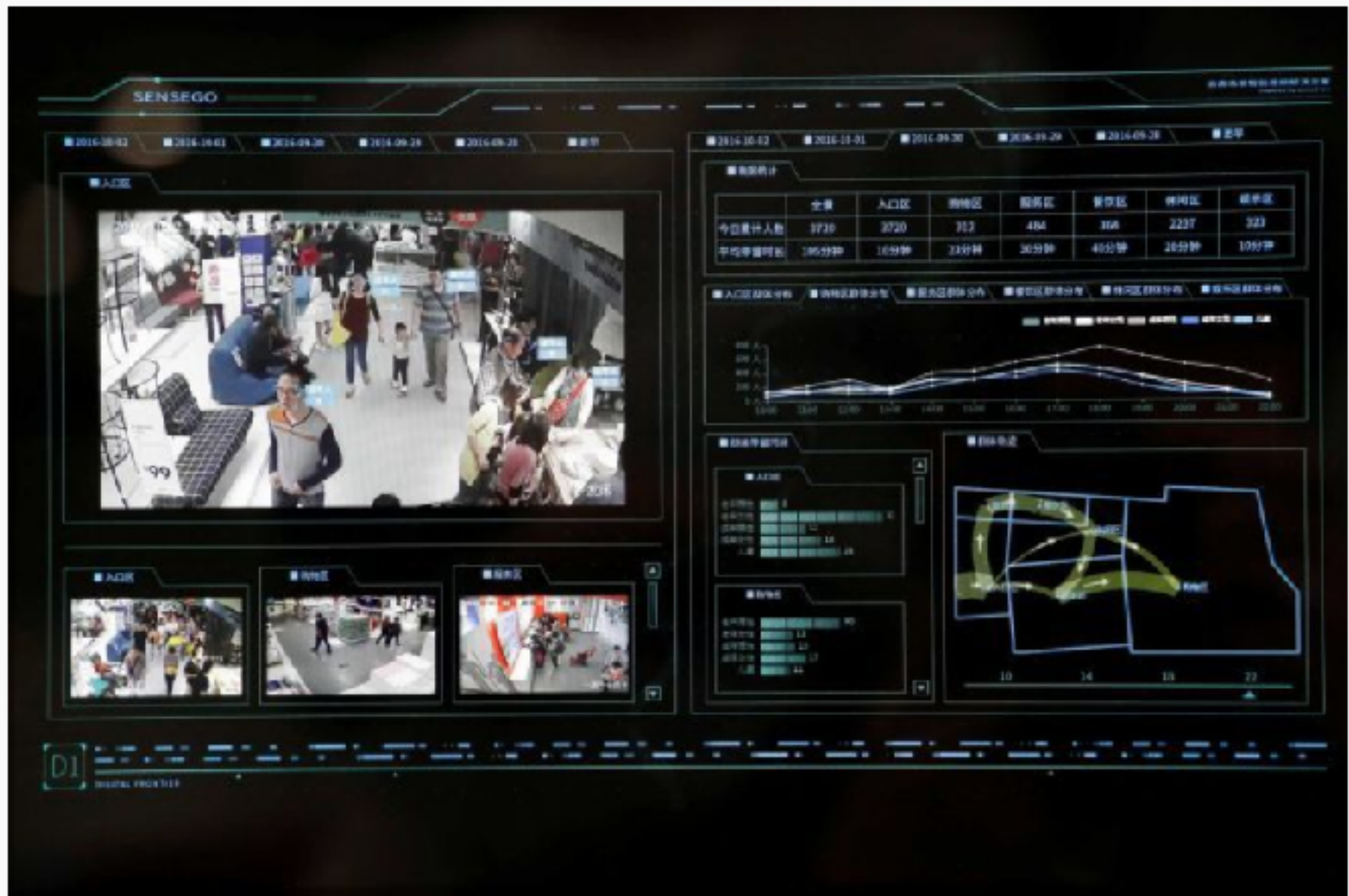
PHOTO: Surveillance software identifying customers' patterns at a department store in Beijing. (Reuters: Thomas Peter)

As the national system is still being fully realised, dozens of pilot social credit systems have already been tested by local governments at provincial and city levels.