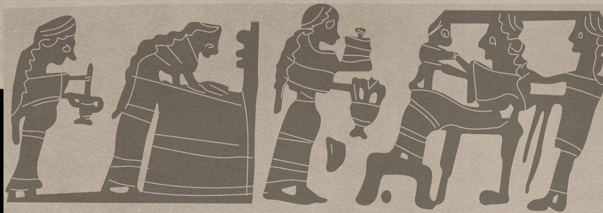
Η κυρία του σπιτιού φροντίζει το παιδί της. The lady of the house takes care of her child.